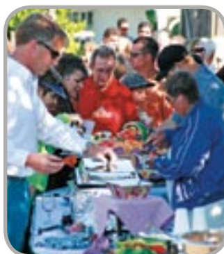
Petaluma Scene - A visual look back on recent local events and charitable fundraisers