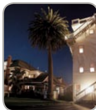
Destinations - Things to do, places to go, find the best places to unwind and discover.