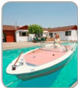
Petaluma Potpourri - Unique, often humorous and always educational facts about Petaluma