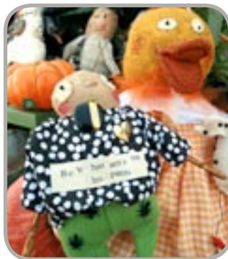
75 Days - The community calendar providing a list of events and entertainment for the upcoming months