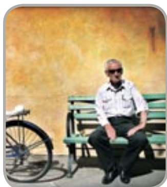
Photo Page - A beautiful array of photographs detailing a particular area of Petaluma